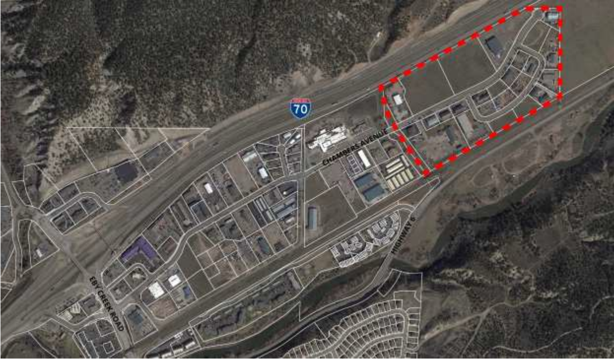
Exhibit B. Area where Medical Marijuana Infused Products Manufacturers, Retail Marijuana Products Manufacturers, and Marijuana Testing Facilities are permitted.