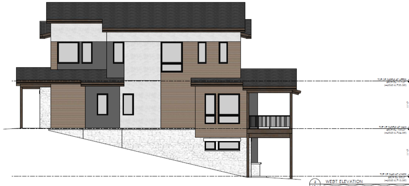
Proposed Changes to West Elevation