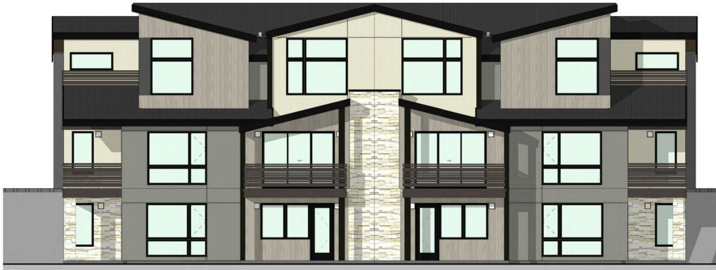
Approved 2022 South Elevation