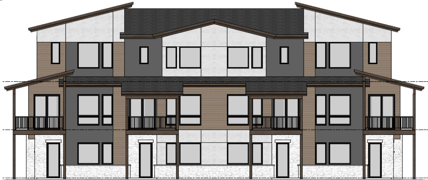
Proposed Changes to South Elevation