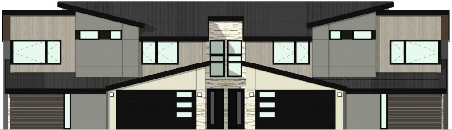
Approved 2022 North Elevation