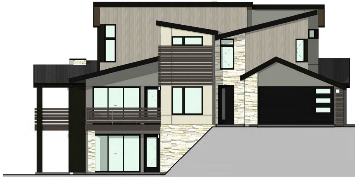
Approved 2022 East Elevation