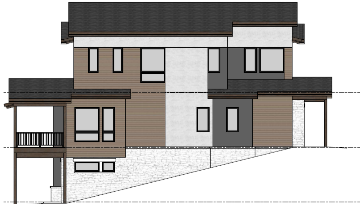
Proposed Changes to East Elevation