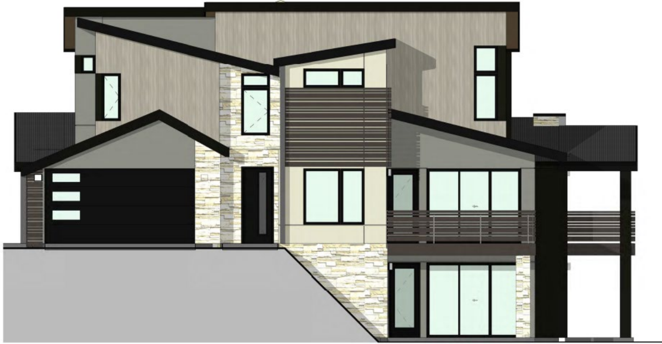
Approved 2022 West Elevation