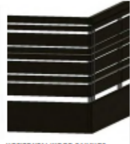
HORIZONTAL WOOD RAILINGS WOOD SLATS 2 x 4 & 2 x 6 DIMENSIONAL LUMBER COLOR: RECLAIMED PICKLE STAINED