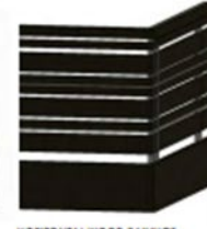
HORIZONTAL WOOD RAILINGS WOOD SLATS 2 x 4 & 2 x 6 DIMENSIONAL LUMBER COLOR: RECLAIMED PICKLE STAINED