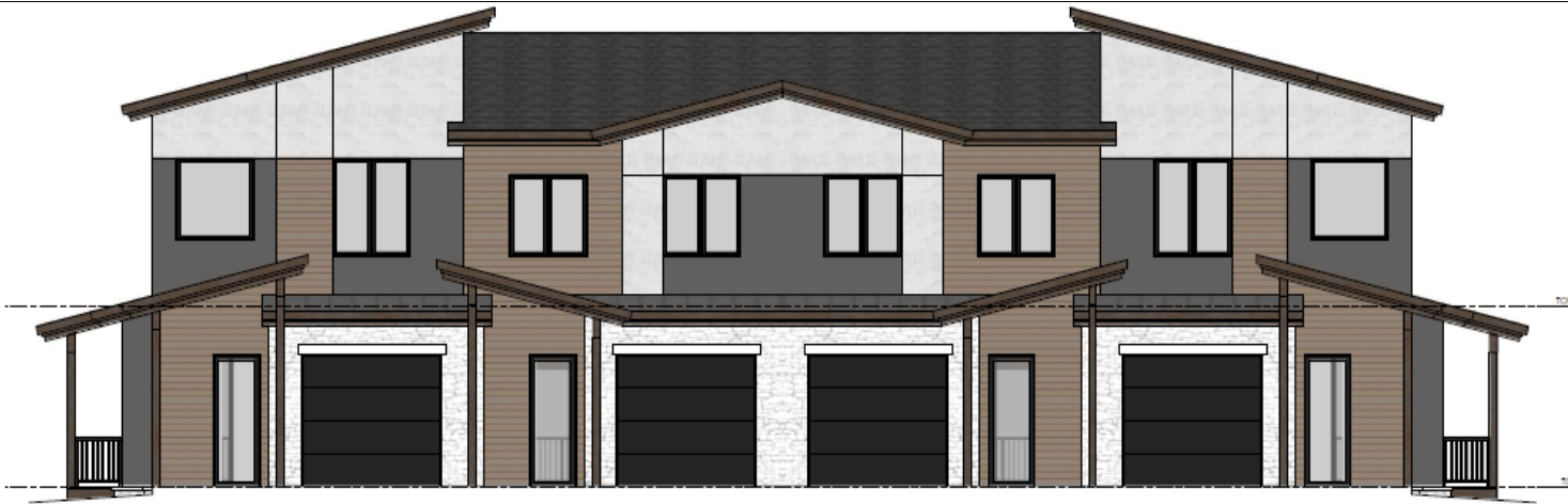
Proposed Changes to North Elevation